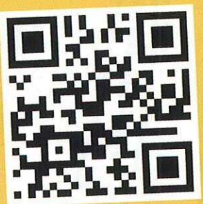
Scan to request more information

If you cannot afford college on your own, Job Corps College Sponsorship may be the right fit for you. Contact our Outreach staff for program information and to see if you may qualify. Your educational opportunity may be waiting for you!